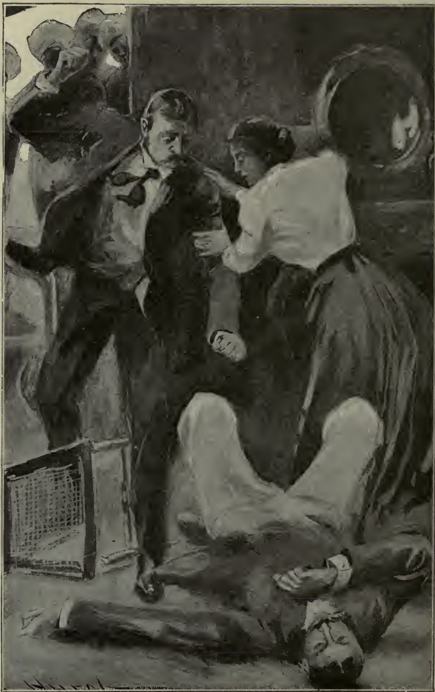
KNOCKED HIM DOWN